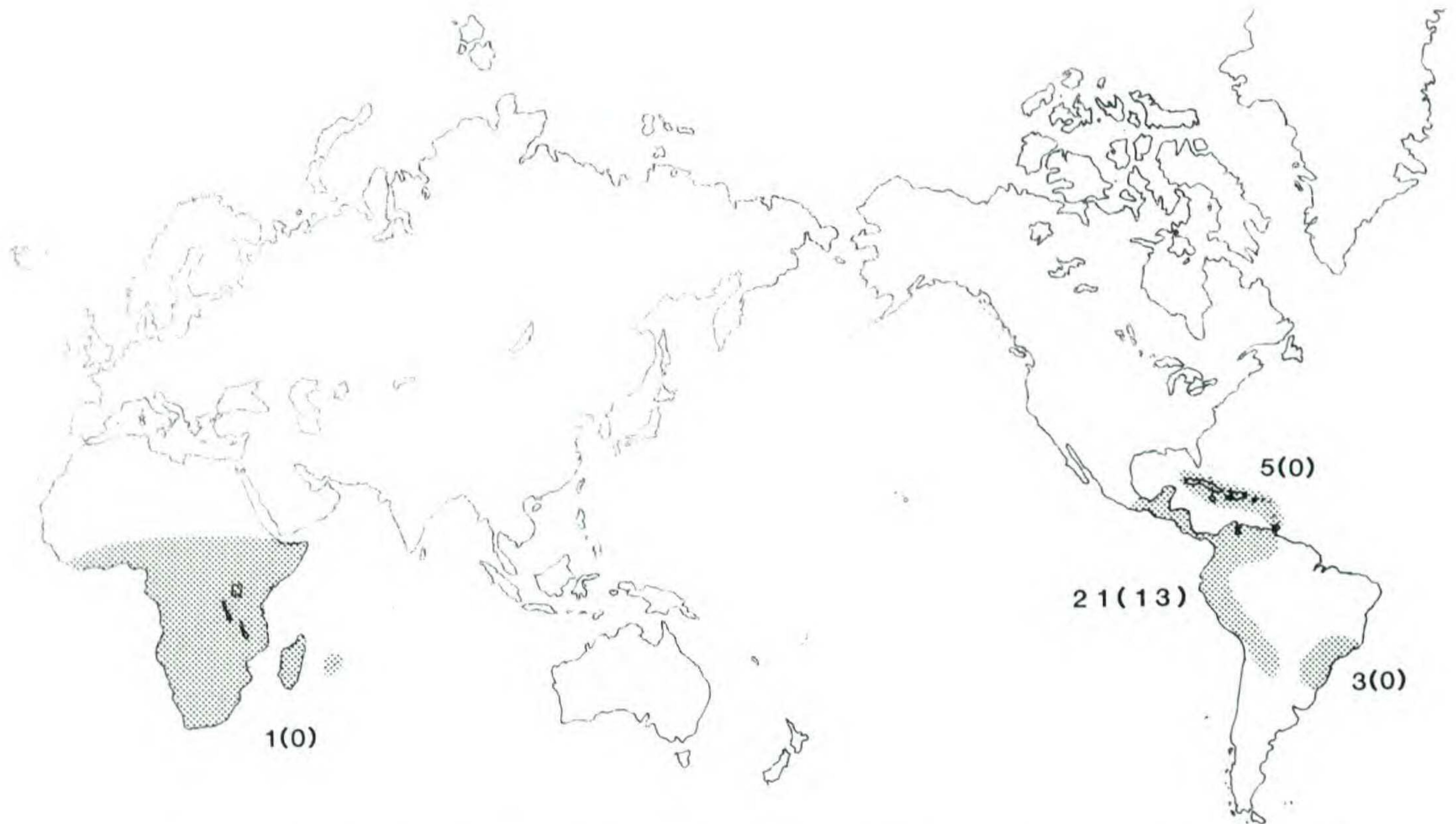
Figure 2. Worldwide distribution of Melpomene . The number on the left is the number of species in the region; the number in parentheses is the number of those species endemic to the region.