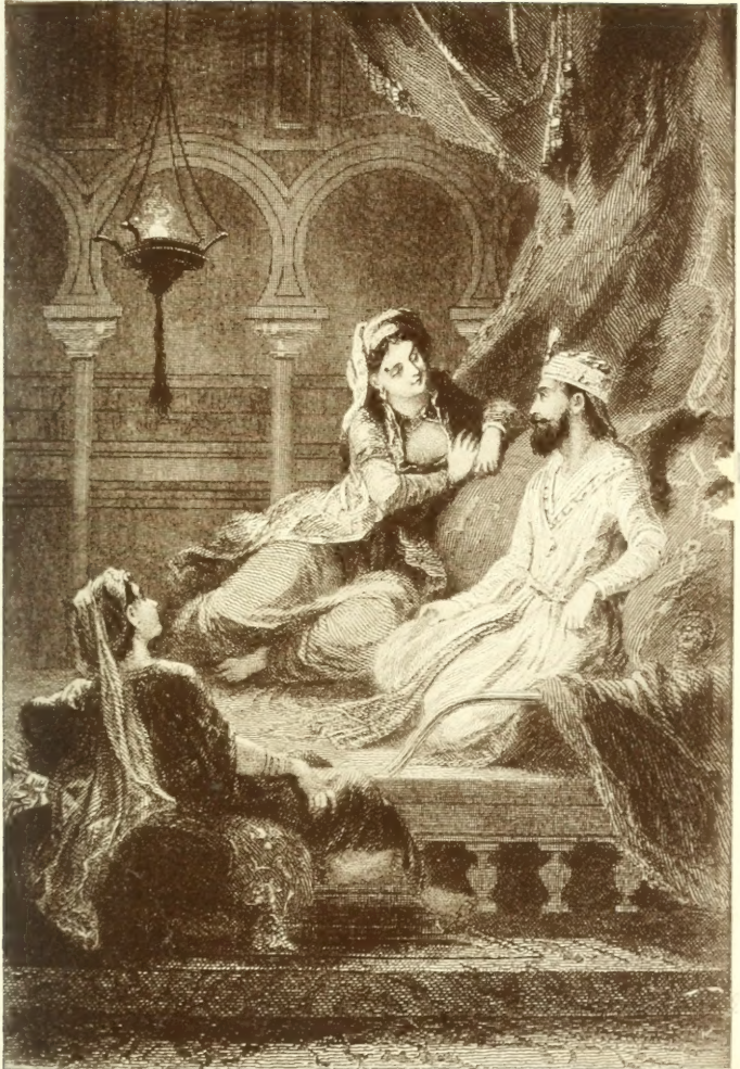
Shahrazad relating a story to the Sultan