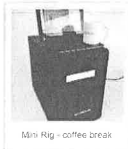
Mini Rig - coffee break